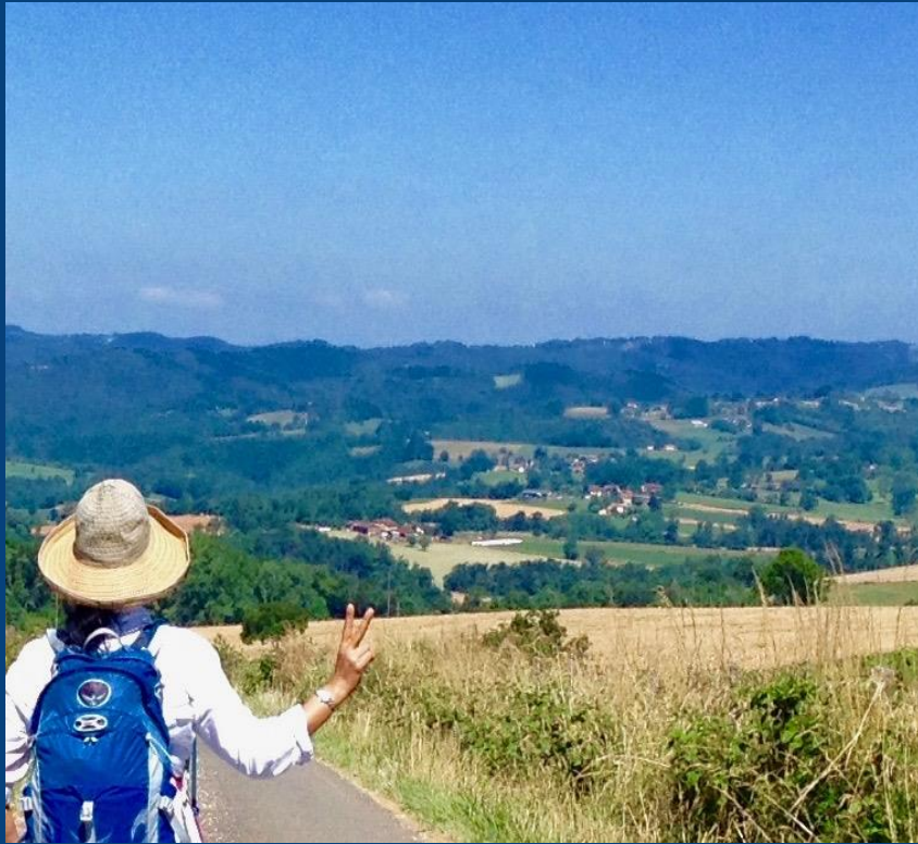
Le Puy, France GR- 65 June-July 2017