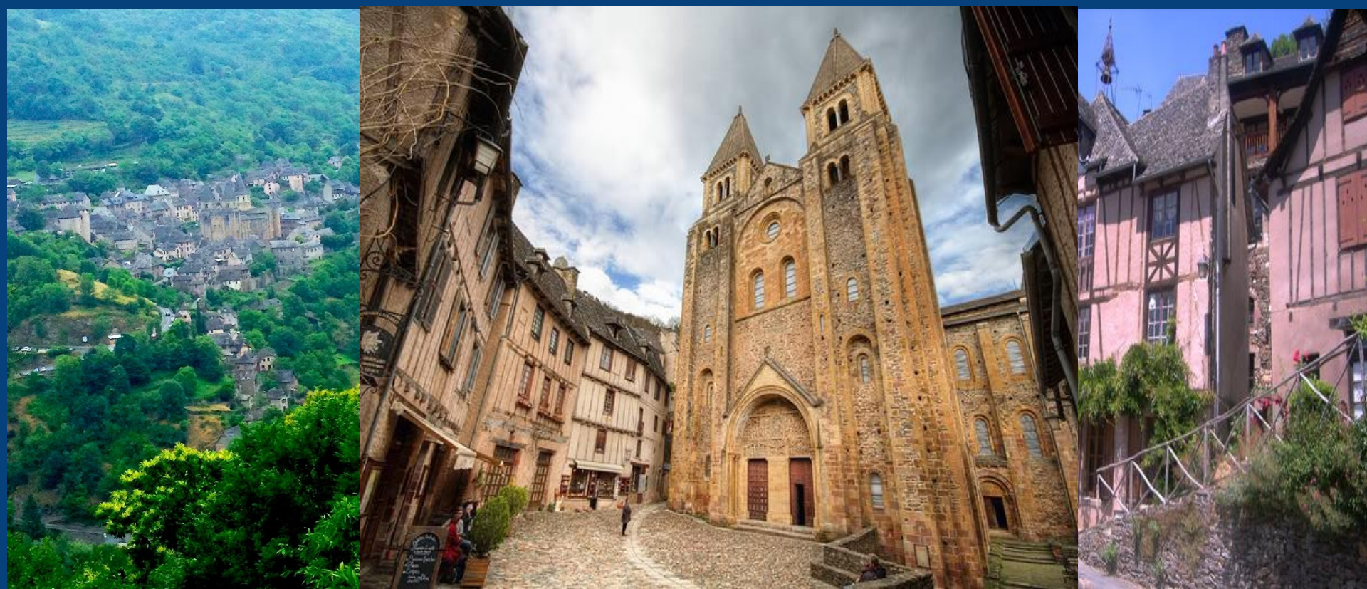
Conques – The Abbey of St. Foy, built in 8 th century