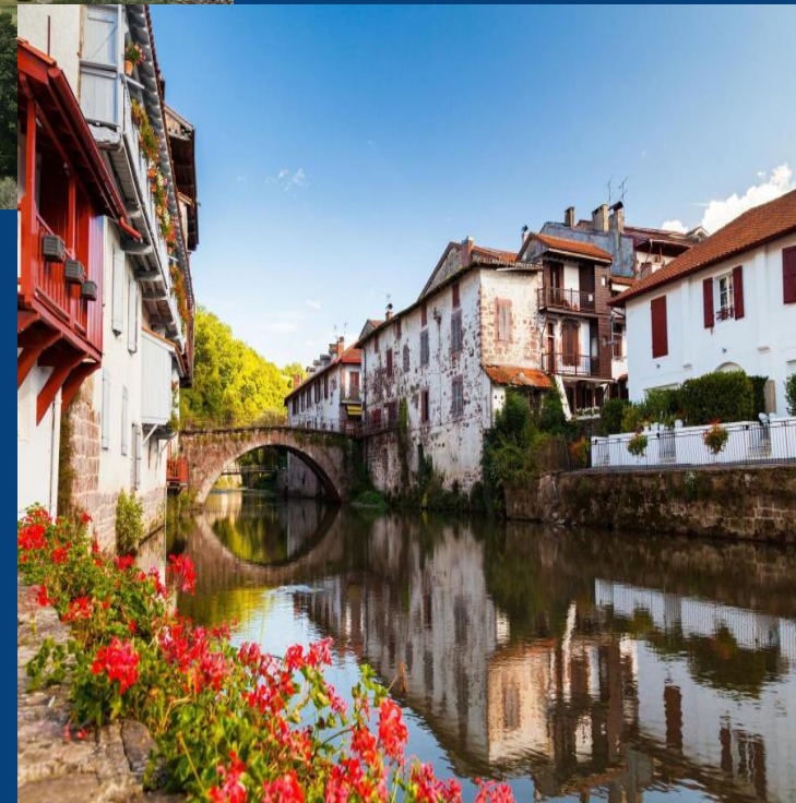
St. Jean Pied du Pord